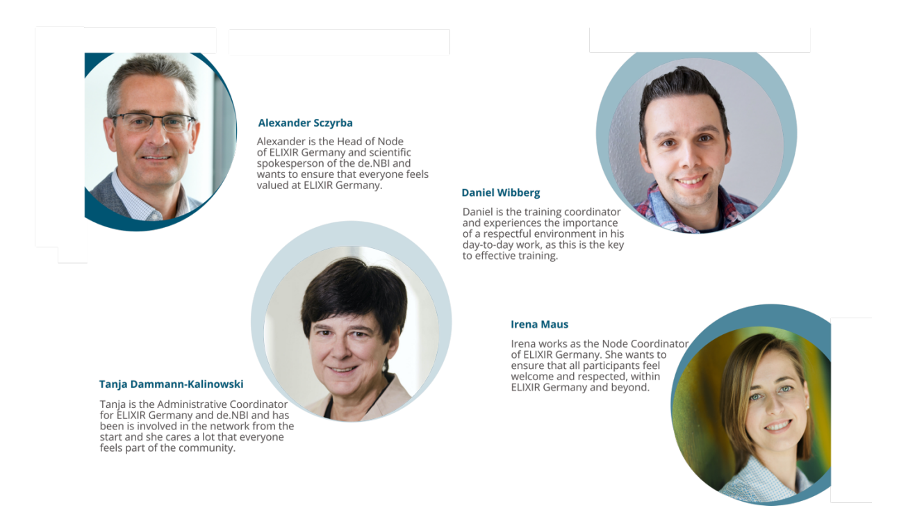
Figure 1: The de.NBI/ELIXIR Germany CoC Oversight Group